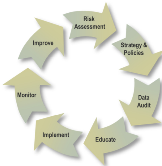
Figure 73: Identifying potential risks is the first step