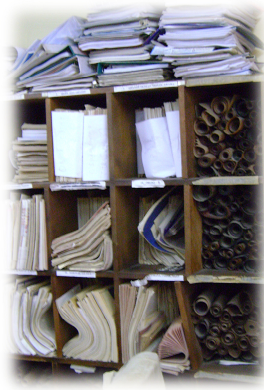
Figure 92: Physical well logs stored in an oil company's offices