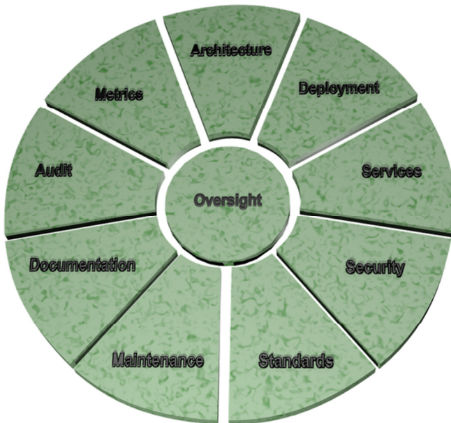
Figure 99: Ten Infrastructure & Application functions