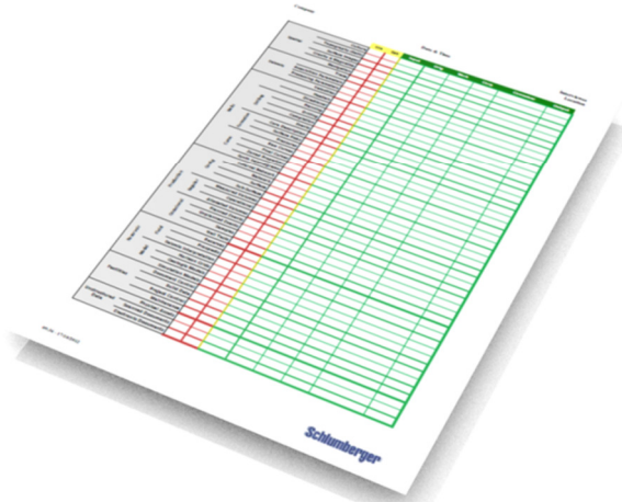
Figure 100: Physical artifacts can encourage interviewee participation